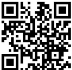
VVT route planner download